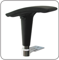
A4 Chrome adjustable arm