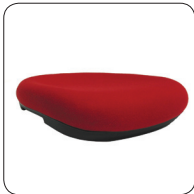
S6 Larger seat option