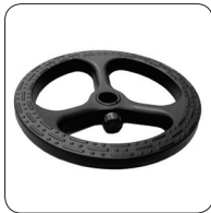
D3 & D4 Black plastic footring