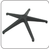
B10 Black spider base