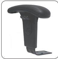
A5 Height adjustable arm

Back Size: 430 W x 510 H (High back) 430 W x 430 H (Medium back) Seat Size: 480 W x 460 D 500 W x 460 D (S2) 515 W x 480 D (S5) Seat Height: 450 - 580 (Typist / Clerical) 560 - 760 (Drafting standard D1 & D3 footring) 630 - 890 (Drafting standard D2 & D4 footring)