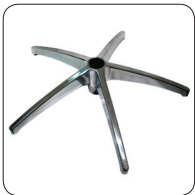
B11 Polished spider base