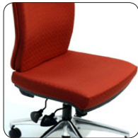
S4 Square seat option