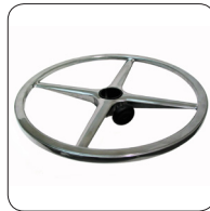
D11 & D12 Aluminium footring