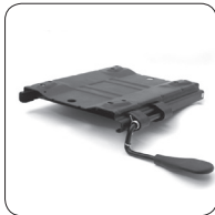
SS Slide seat