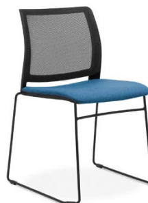
CS O 2 Mesh Seat Pad