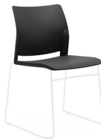
CS O 2 Black, White Sled