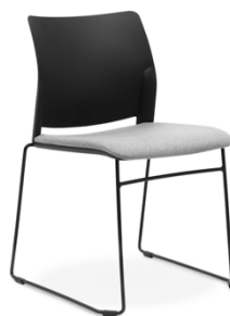
CS O 2 Black with Seat-Pad, Black Sled