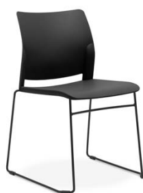
CS O 2 Black, Black Sled