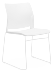
CS O 2 White, White Sled