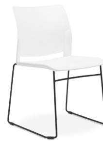
CS O 2 White, Black Sled