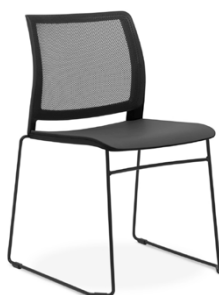
CS O 2 Mesh Black