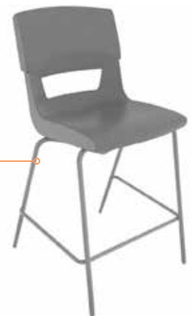
Postura 4 leg