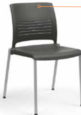
Strive 4 leg