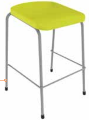
Focus 4 leg