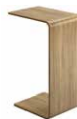
⑦ C shaped laptop table

Need more information? Call our friendly Cairns team on