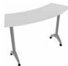
Curved frame 1072mm W x 450mm D x 720mm H

Also available in a wide range of fixed frame shapes