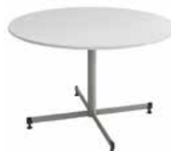
⑥ Focus table 1350mm diameter Available with a writeable or standard top