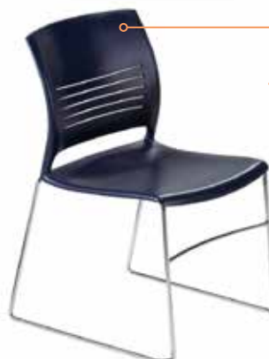
High density stacker