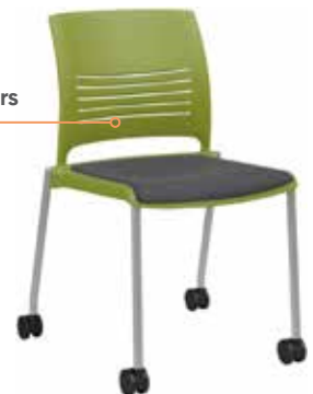
Strive 4 leg with castors