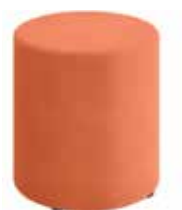
⑤ Round ottoman 400mm diameter x 440mm H on glides