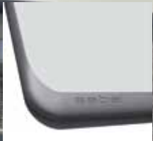
Includes Sebel's 'Performance Edge'