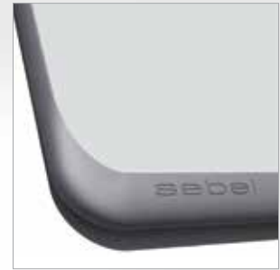
Performance Edge available