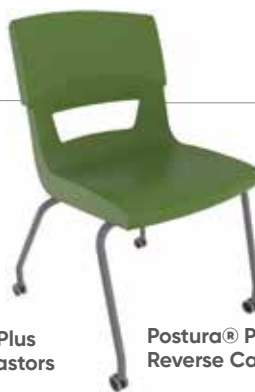
Postura ® Plus 4 leg on castors