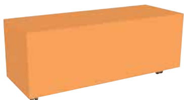
① Bloc junior ottoman 1800mm W x 450mm D with castors 1200mm also available