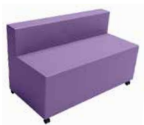
② Bloc ottoman 1800mm W x 600mm D x 720 H back, with castors 1200mm also available