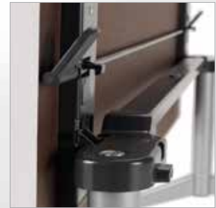
Easy one-handed side latch to allow for easy flip and nest