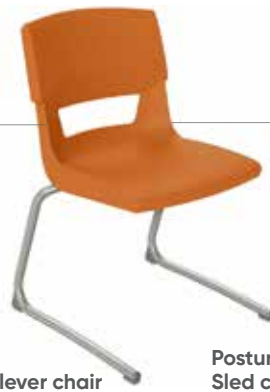
Postura ® Plus Reverse Cantilever chair