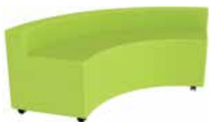
④ Curve ottoman 1980mm W x 600mm D x 720 H back, with castors