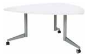
Guitar pick frame 1500mm W x 1500mm D x 720mm H