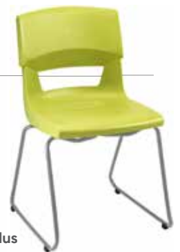
Postura ® Plus Sled chair